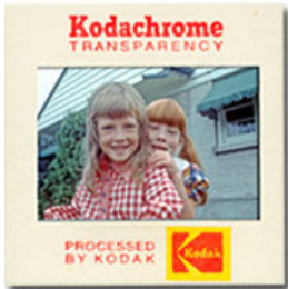
135 Slide (35mm Slide)